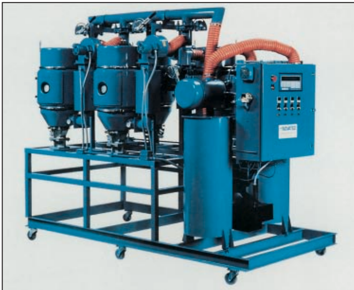
Central Drying System utilizing Moisture Manager Dryer.