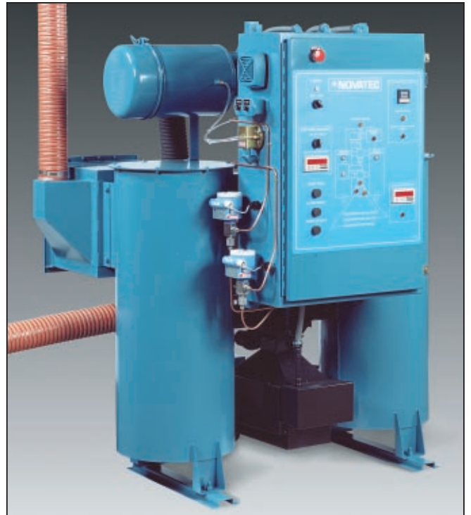
Controllable dew point dryers prevent over-drying certain polyamides and polyesters.

The closed loop drying system includes dual, solid desiccant towers, ensuring maximum air contact time to quickly achieve dew point levels. The “on-process” desiccant tower is automatically regenerated when desiccant nears saturation, while the second, “freshened” tower is brought on-process. Externally mounted desiccant regeneration heaters simplify maintenance.